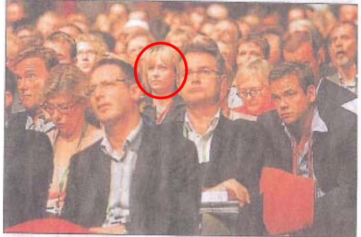
Where's Wally?

Overall, I met some extremely interesting people at the summit, both high profile and no so high profile. All people were treated exactly the same regardless of whether they were high profile or not. I liken the weekend to a “leadership workshop” similar to something I’d attend in the region, which was not intimidating at all.