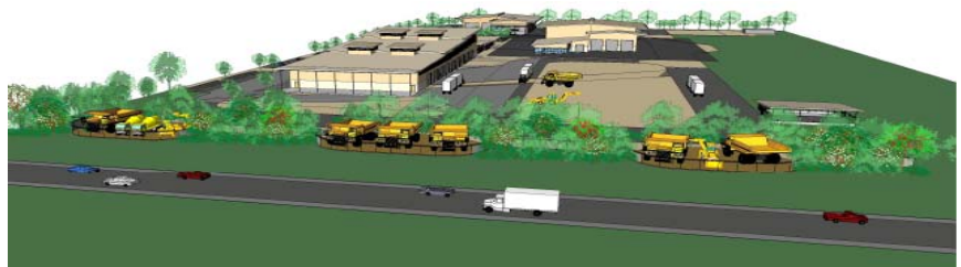
Artist impression of new Hastings Deering facility at Caterpillar Drive

The company is one of the largest employers in the Mackay Area with a current workforce in excess of 400 people with 52 of these being apprentices. An additional 16 apprentices will be employed in Jan 2008 and an estimated additional 80 tradespeople will also be employed at the completion of the new facility.